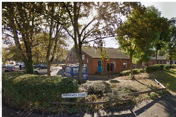
LCIL Building as seen from Andrewes Street when approaching from Dane Street