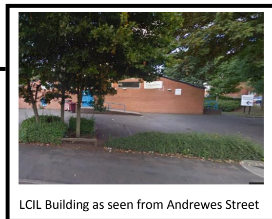
LCIL Building as seen from Andrews Street